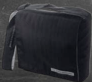
The soft carrying case

The AS608 / AS608e will operate with 3 standard AA batteries or a medically approved external power supply. Typical battery life is six months.