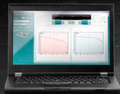
Diagnostic Suite software (AS608e only)